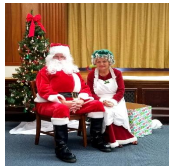
Santa and Mrs Claus December 15 th