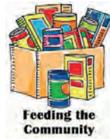
Feeding the Community