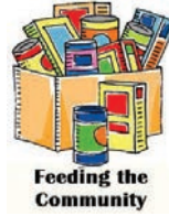
Feeding the Community