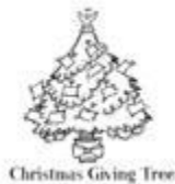
Christmas Giving Tree

Our Parish Giving Tree benefits families in Bridgeport through the Caroline House and the St. Charles Outreach Center. Please take an ornament off the tree, purchase and wrap the gift listed and place the gift under the tree. It is very important to attach the original ornament gift tag to the gift . Its color and description tells us where to deliver the gift. Because these centers close for Christmas, please return all gifts by the weekend of December 9 th and 10 th .