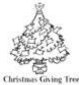
Christmas Giving Tree

Our Parish Giving Tree benefits families in Bridgeport through the Caroline House and the St. Charles Outreach Center. Please take an ornament off the tree, purchase and wrap the gift listed and place the gift under the tree. It is very important to attach the original ornament gift tag to the gift . Its color and description tells us where to deliver the gift. Because these centers close for Christmas, please return all gifts by the weekend of December 9 th and 10 th .