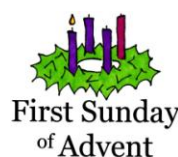
First Sunday of Advent